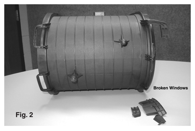
Failure to disengage the inlet/outlet cover tabs from the filter windows can result in broken windows, preventing a proper sealing of the filter.