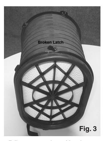
Failure to properly position the spring clamps on the plastic latches will result in broken latches. Attempting to pull the cover plate onto the filter seal with the force of the spring clamps will result in broken latches.

the filter must be discarded, to prevent engine and turbocharger damage. Only when the cover plate is properly seated on the filter seal is it acceptable to close the spring clamps. Make certain the clamps are fully seated into the plastic latches on the filter. Close the inboard clamp first, while keeping pressure on the cover and seal. Then, close the outboard clamp, while exerting the same pressure on the cover.