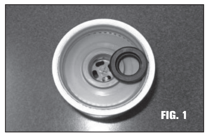
Check for detached filter grommet.

A second condition involves technicians complaining of a difficult fuel filter installation. A frequent complaint is the filter will not thread onto the filter adapter. The installer is usually certain that damaged filter housing threads are the reason for the installation difficulty. The culprit is usually a grommet from the previous filter that is still attached to the filter adapter, making it impossible to install the new filter (see Fig. 1).