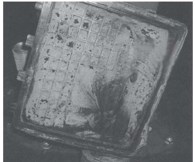
Look for dust/dirt on the clean air side of the filter housing

Chrysler cautions its dealer technicians to inspect any turbo diesel engine failure for the presence of dusting. Engines damaged due to dirt/dust entering through the air intake will not be warranted. Engines that exhibit symptoms caused by improper air filter maintenance may include knocking, hard or no-start, loss of power, oil consumption, rod or main bearing failure, broken rods, excessive blow-by, oil on turbo, etc. Vehicles which exhibit large amounts of dust/dirt accumulation are candidates for dusting damage if not properly maintained, or the incorrect air filter has been installed. The following illustration provided by Chrysler reflects filter by-pass/dusting on a 6.7L turbo diesel. Damaged engines with dust/dirt on the "clean air side" of the air filter may not qualify for warranty coverage.