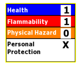
HMIS RATINGS (0-4)